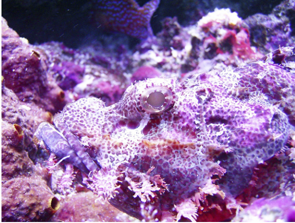
Figure 2. Stonefish. This camouflaged animal can easily be confused with a rock or coral from the bottom of the sea. The dorsal spines shown contain dangerous venom that could threaten a person's life.

and venom is released from two lateral glands in every spine base upon mechanical pressure. This is a defense and self-preservation mechanism that is not used for attacking prey (Figure 2) (82). The venom of the stonefish is one of the most powerful known to man, comparable in potency to that of the cobra (83).