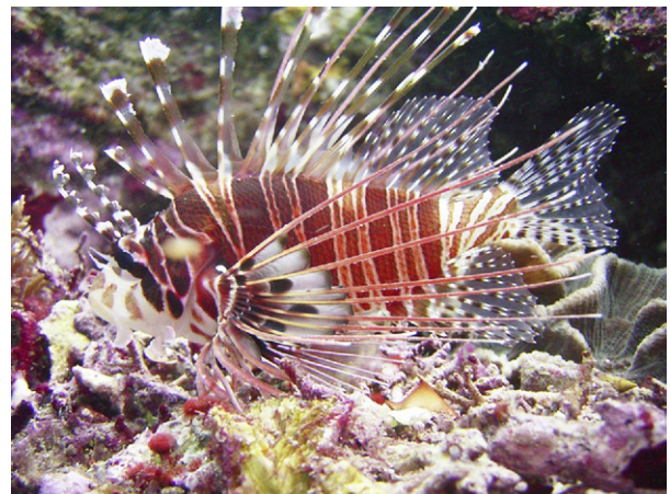
Figure 3. Lion fish. This fish has many long dorsal and fin spines, all containing venom.

All the spines must be removed, and the affected limb must be elevated and cleaned with clear running water. Afterwards, direct pressure should be applied to prevent excessive bleeding. The affected limb should be immersed in water heated to an approximate temperature of 45°C (never boiling water) to relieve acute pain. In addition, supplemental local or oral analgesia may be administered. Tetanus prophylaxis should also be administered and the patient should be observed for 6–12 h. Plain radiographs to ensure the removal of all spines should also be performed. There is no need for antibiotic